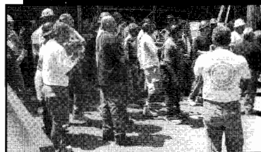
Union members at non-union construction site, fighting the fight. We shut the job down for the day.